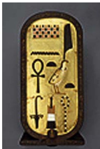
Cartouche of Tutankhamun

Cartouches, also known as name rings or royal rings, were inscribed with the royal titles of the Egyptian kings. The cartouche consists of a line enclosing the birth and throne names of the pharaoh in hieroglyphs. The line is actually a length of rope, the ends of which overlap.